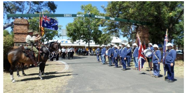
Re-enactment marchers at 2014 Gilgandra Coo-ee Festival memorial service

A centenary re-enactment of the 1915 Coo-ee March is planned to be held from 17 th October to the 11 th November 2015 to commemorate the march, and the men who joined its ranks, with parades and memorial ceremonies at the villages and towns where the original Coo-ees stopped and recruited men to join up and enlist in the AIF during the First World War. The planned itinerary is as follows: